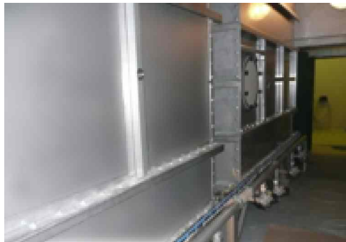
Indoor stainless steel silos