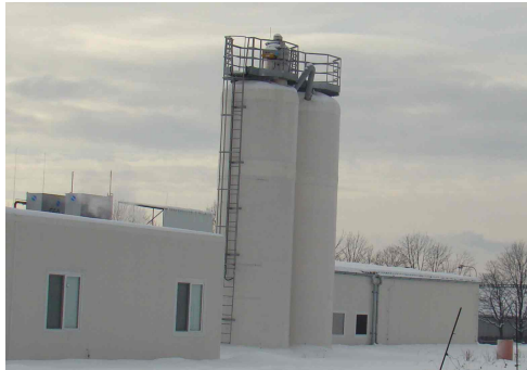
Silos, flour transport