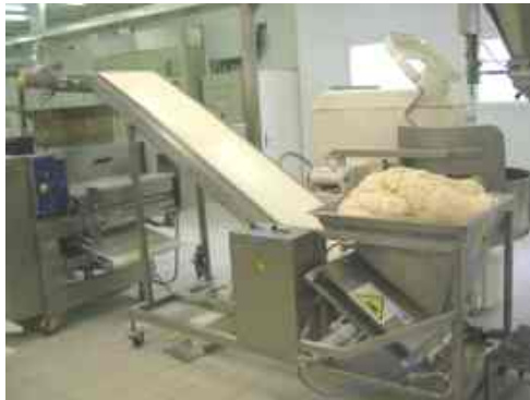
Stainless steel conveyers